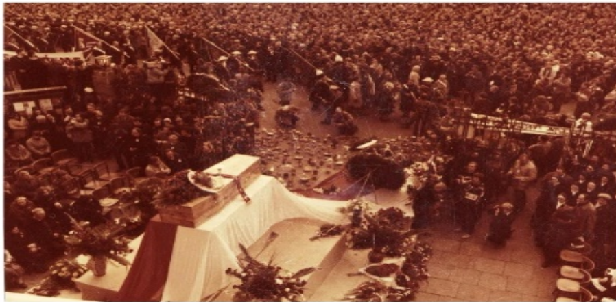
Uroczystości pogrzebowe ks. Jerzego

(Father Jerzy Popieluszko's funeral ceremony)