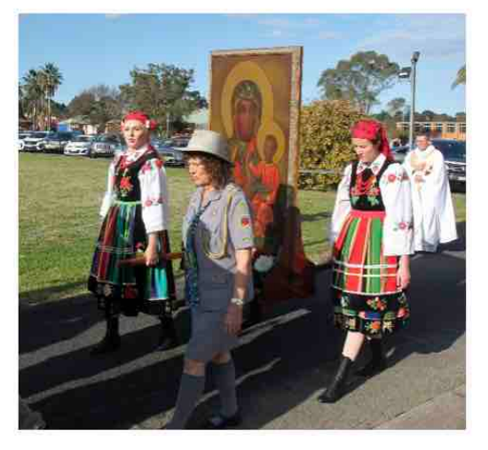
Photos: Church of Our Lady of Czestochowa and Queen of Poland in Marayong