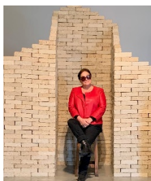
Written by: Danuta Piotrowska